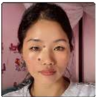
MUM TAMUT 2000014

PREMIUM INSTITUTE FOR APPSC AND APSSB EXAMS