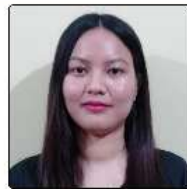
MISS ETER RIBA 2000074