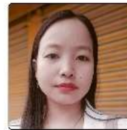
BINAISI CHAI 2000059