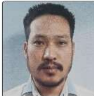
MARJUM LOMI 2000068