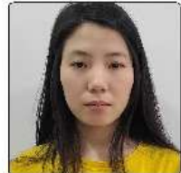
TAPI YAKU 2000069