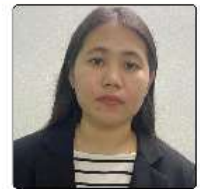
MINU ANGU 2000049