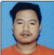
MIBOM KOMUT 2000005