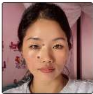
MUM TAMUT 2000014

PREMIUM INSTITUTE FOR APPSC AND APSSB EXAMS